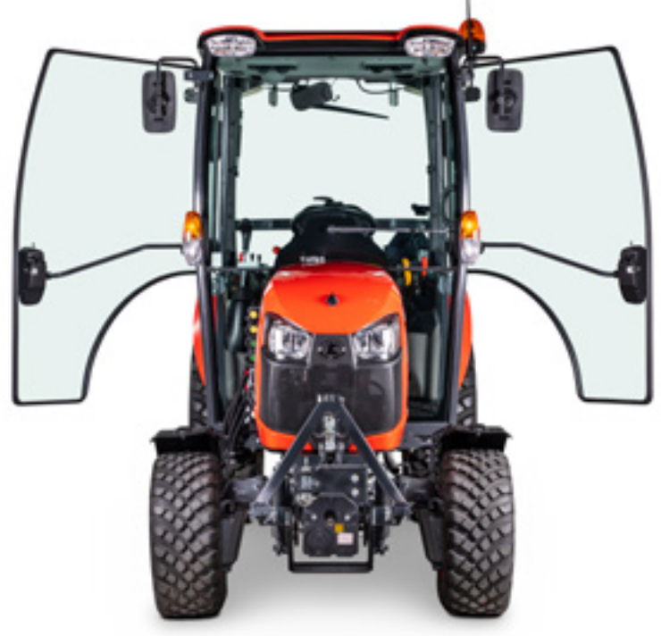
Front-linkage not available in the UK

High daily productivity requires a high level of driving comfort. The comfortable cab of the B2 is designed to enable you to work with concentration over the course of a long working day. This allows you to fully exploit the high performance potential of these machines at all times.