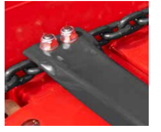
The conveyor slats are designed for quick and easy individual replacement.

Slat spacing has been specially determined to ensure consistent and even feed to the shredding drums. The strong conveyor slats are designed for quick and easy individual replacement. A rotating marker allows the operator to see the speed and direction of the floor conveyor from the tractor seat. The conveyor has an enclosed lower tray to ensure no spillage or crop loss.