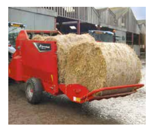
Kverneland 856 Pro will take 3 round bales for maximum capacity.

Extended paddles on the flywheel increase blowing distance and performance significantly. Bolt-on paddles ensure easy replacement in case of damage.