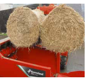
Easy access when loading from the top.