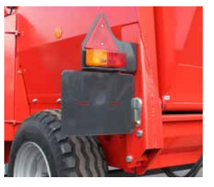
The Kverneland 853 Pro can be fitted with lighting kit, well protected from damages.