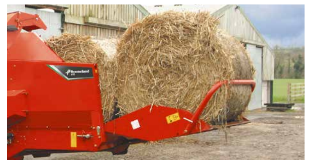
Foldable bale retaining kit.