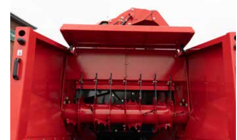
Hydraulic comb and top guard.