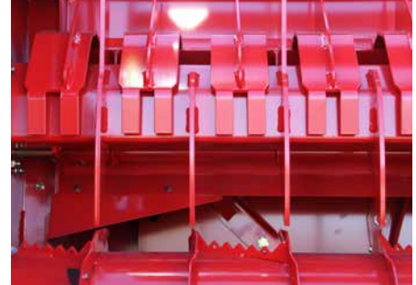
DFCS disengaged for maximum flow through the flywheel.