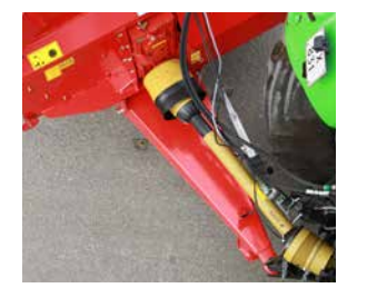
Long drawbar and wide angle PTO for improved turning with larger tyred tractors is standard.