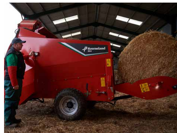
Operating both tailgate and floor chain in safe distance from the moving parts, by using the remote control placed on the side of chamber.

The tailgate offers the ability to carry a second round bale for increased capacity. Total lift capacity of the rear door is 1200kg. A foldable bale retaining kit can be fitted to the end of the tailgate to ensure that the bales stay in position during operation.