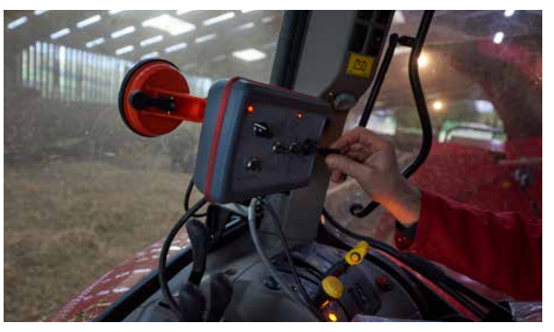
The 4-stage swivel chute is operated by the intuitive controlbox joystick.

On top of the control terminal located inside the tractor cab, the Kverneland bale choppers are equipped with an additional remote controlled switch for the floor chain and tailgate (optional for 852 and 856 Pro).