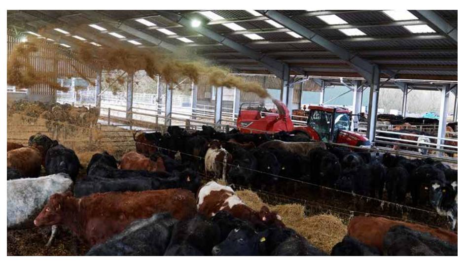
A blowing distance up to 20m, depending on conditions, ensures excellent reach and operability.