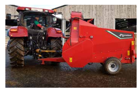
An extended drawbar provides best possible maneuverability during operation. The extended drawbar ensures easier operation, especially when turning with larger tyred tractors.