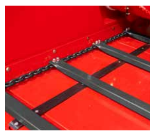
UltraGlide strips reduce wear to a minimum. (optional for 852).