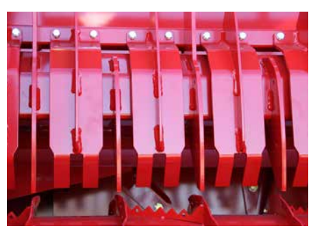
DFCS engaged to reduce the risk of blockages during loading and flywheel start up.