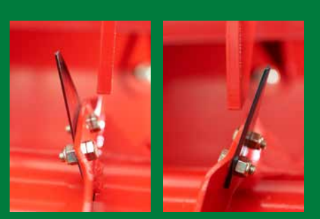
A Kverneland patented system the knives pass the fixed comb on alternative sides for a more even cut.