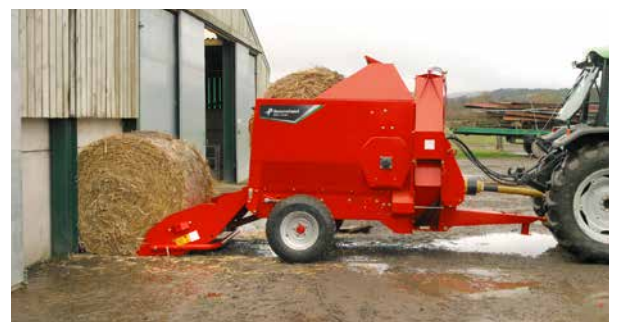
Easy self-loading of baled material.