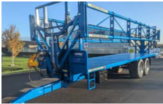
2023 STEWART GX 15 BH (32' long. 15t carrying capacity) C/W - Sprung drawbar, commercial axles with 560/60 R22.5 wheels, air & oil brakes with ABS. Hydraulic bale clamp sides. Suitable for 2-high bales or cabbage bins.