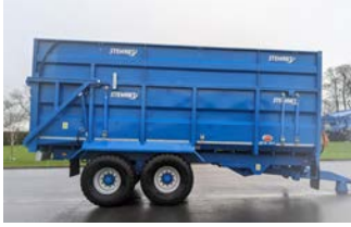
2022 STEWART GX 18 23 S C/W - Sprung drawbar, commercial axles with 560/60 R22.5 wheels, air & oil brakes with ABS, hydraulic rear door with grain chute, rollover easy sheet and silage kit. Also available in GX 16 21 L Version.