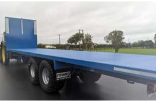
2023 STEWART GX 18 FT (36' long. 18t carrying capacity) C/W - Sprung drawbar, commercial axles with 560/60 R22.5 wheels, air & oil brakes with ABS. Hydraulic lift & lowered headboard.