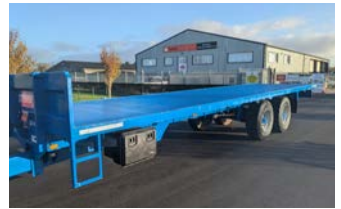
2023 STEWART GX 15 FT (32' long. 15t carrying capacity) C/W - Sprung drawbar, commercial axles with 385/65 R22.5 wheels, air & oil brakes with ABS. Hydraulic lift & lowered headboard.