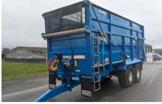
2022 STEWART GX18 23 S C/W - Sprung drawbar, commercial axles with 560/60 R22.5 wheels, air & oil brakes with ABS, hydraulic rear door with grain chute, rollover easy sheet, silage kit and Transcover front to back hydraulic cover. Also available in GX 16 21 L Version.