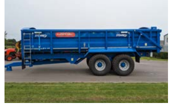
2023 STEWART GX 16 20 R (16t Root Spec. 3'9" Sides) C/W - Sprung drawbar, commercial axles with 560/60 R22.5 wheels, air & oil brakes, hydraulic rear door with grain chute, and rollover easy sheet.