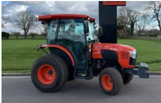
KUBOTA L2-622 COMPACT TRACTOR Ref. GC29248