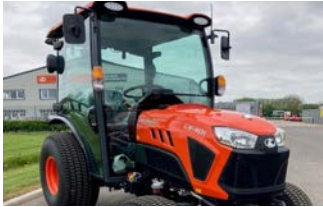
KUBOTA LX-401 COMPACT TRACTOR Ref. GC29250