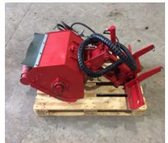
20 INCH HYDRAULIC DRIVEN FLAIL Ref. GC1731