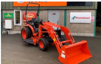
KUBOTA LX-351 COMPACT TRACTOR Ref. GC29249