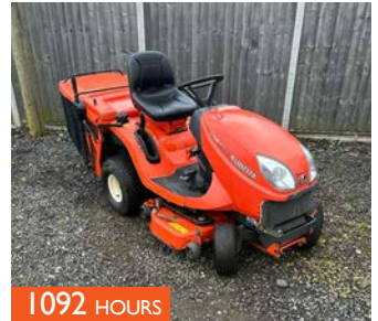
2006 KUBOTA GR1600-II RIDE ON MOWER Ref. GC29279