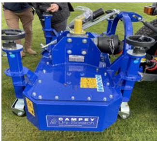
CAMPEY UNI-SCRATCH Ref. GC19637 For maintenance of natural and synthetic grass surfaces.