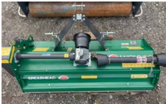
SPEARHEAD SNIPER 150 MOWER Ref. GC13819