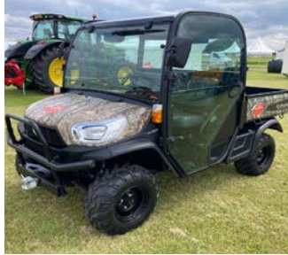
KUBOTA RTV X1110 UTILITY VEHICLE Ref. AG28765