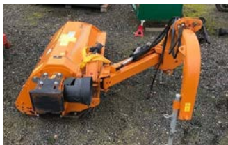
2016 BERTI TA/PS 200CM (TEAGLE) MOWER Ref. AG25714