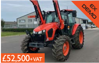
2023 KUBOTA M5-112 TRACTOR & LOADER Ref. AG27634