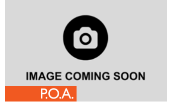
2015 KUBOTA R085 WHEELED LOADER Ref. 31011219