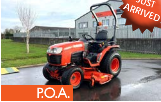
2021 KUBOTA B2530 COMPACT TRACTOR Ref. 11011238