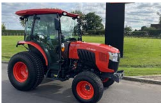
KUBOTA L2-452 COMPACT TRACTOR Ref. GC29231