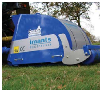
IMANTS ROOT PRUNER Ref. GC20777 Prunes roots up to 100mm in diameter with no clean up.