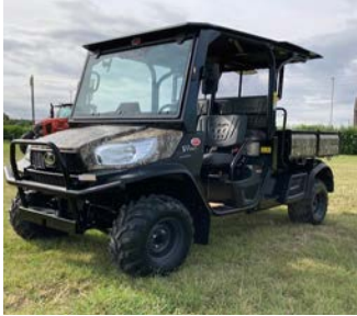
KUBOTA RTV X1140 UTILITY VEHICLE Ref. AG18278