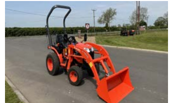
KUBOTA B1181 COMPACT TRACTOR & LOADER Ref. GC18890