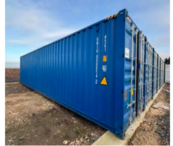
40FT SHIPPING CONTAINERS Ref. GC31185 Call for full details and availability