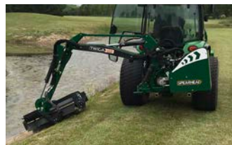
SPEARHEAD S32 COMPACT HEDGE CUTTER Ref. AG27386