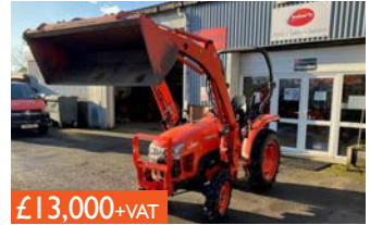
2018 KUBOTA L1361 COMPACT TRACTOR & LOADER Ref. GC31024