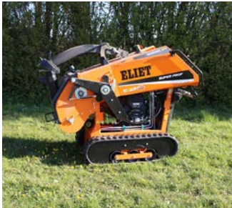
ELIET SUPER PROF CROSS COUNTRY MAX TRACKED SHREDDER Ref. GC13906