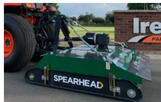
SPEARHEAD ROLLICUT 170 Ref. GC13814