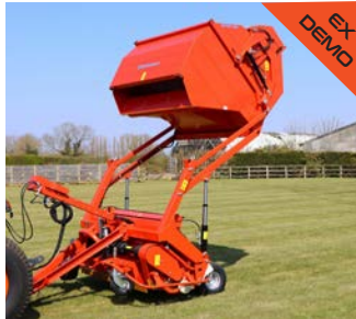
WIEDENMANN SUPER 500 FLAIL COLLECTOR Ref. GC13918