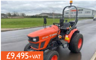
KUBOTA EK1-261 COMPACT TRACTOR Ref. GC29055