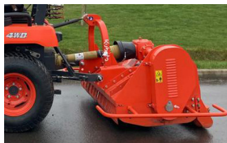
TOMLIN TFM FLAIL MOWER Ref. GC14393