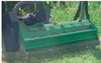
SPEARHEAD SNIPER 190 MOWER Ref. GC13805