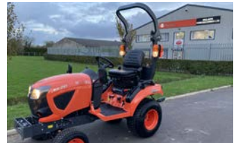
KUBOTA BX261 26HP SUB COMPACT TRACTOR Ref. GC28108