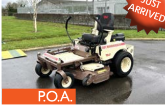
GRASSHOPPER 100 ZERO TURN MOWER Ref. 11011239 Only 174 hours